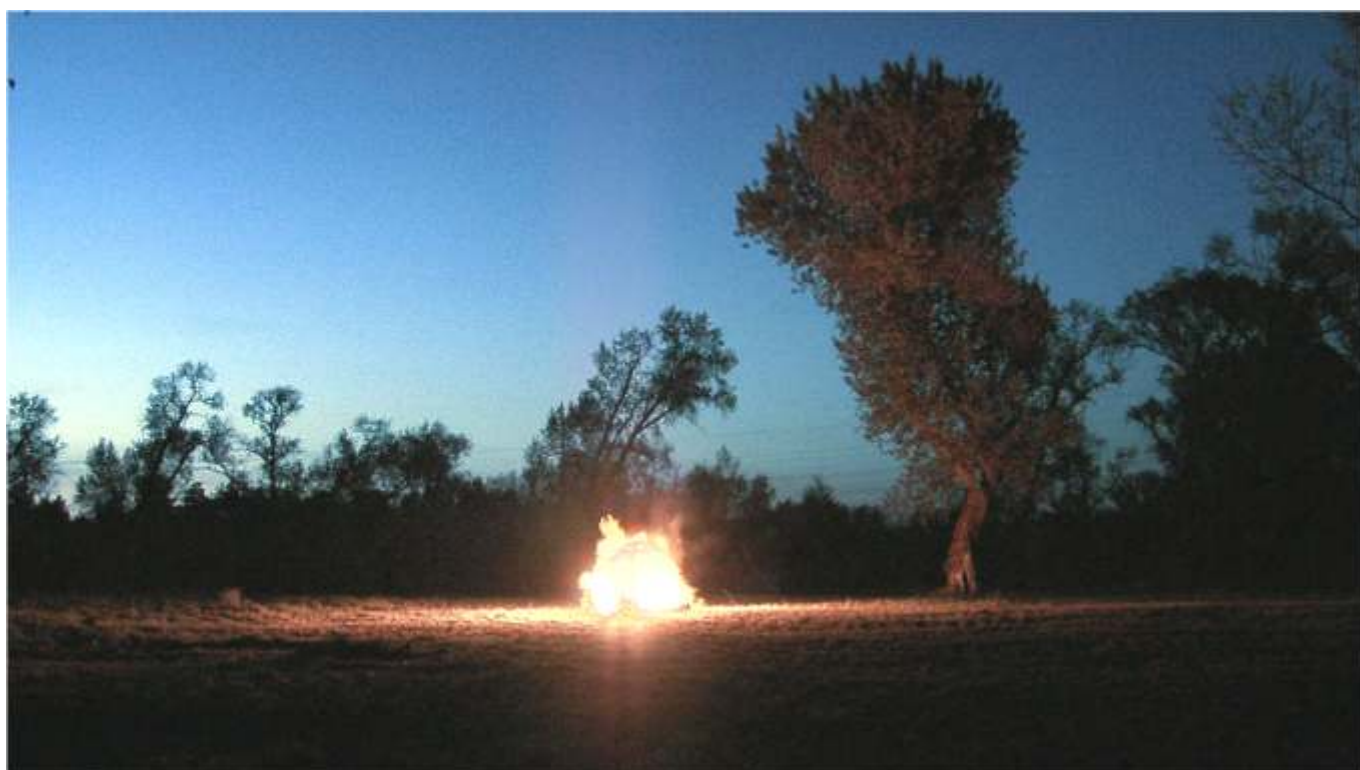
„Tent”, 2007, video 2:45 min. (loop), channel 2 of 2