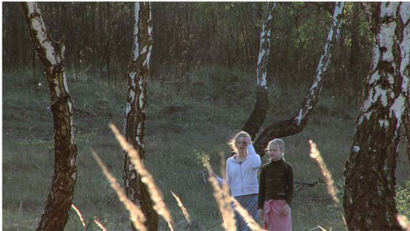
„Tent”, 2007, video 2:45 min. (loop), channel 1 of 2

This project is about the risk which is inherent part of our chaotic world. It is about the risk as a specific potential, possibility of failure. Hope for success, which inseparably goes together with a threat of fiasco. Kind of ambivalent and grotesque, which in some sense accompanies every, even the most prosaic activity. Sequence of causes and effects of our doings and things happening around is impenetrable. Certainly not in real time. It is extremely complicated mathematics. We are surrounded by beautiful chaos. We also have beautiful chaos inside us. Sometimes we realise that even during simple routine activity, even during inactivity we can become a victim of a disaster. Small, big, whatever. The world and the time are jam-packed with disasters.