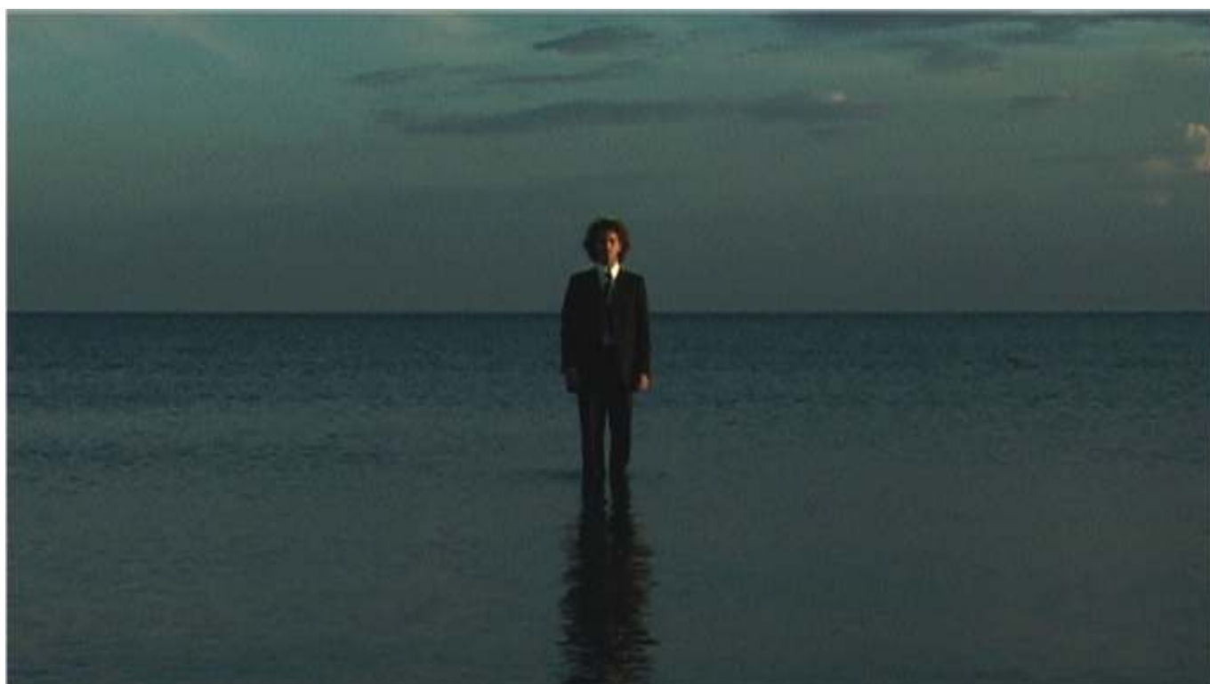
„Usquequaque”, 2006, video 7:00 min. (loop), channel 2 of 7