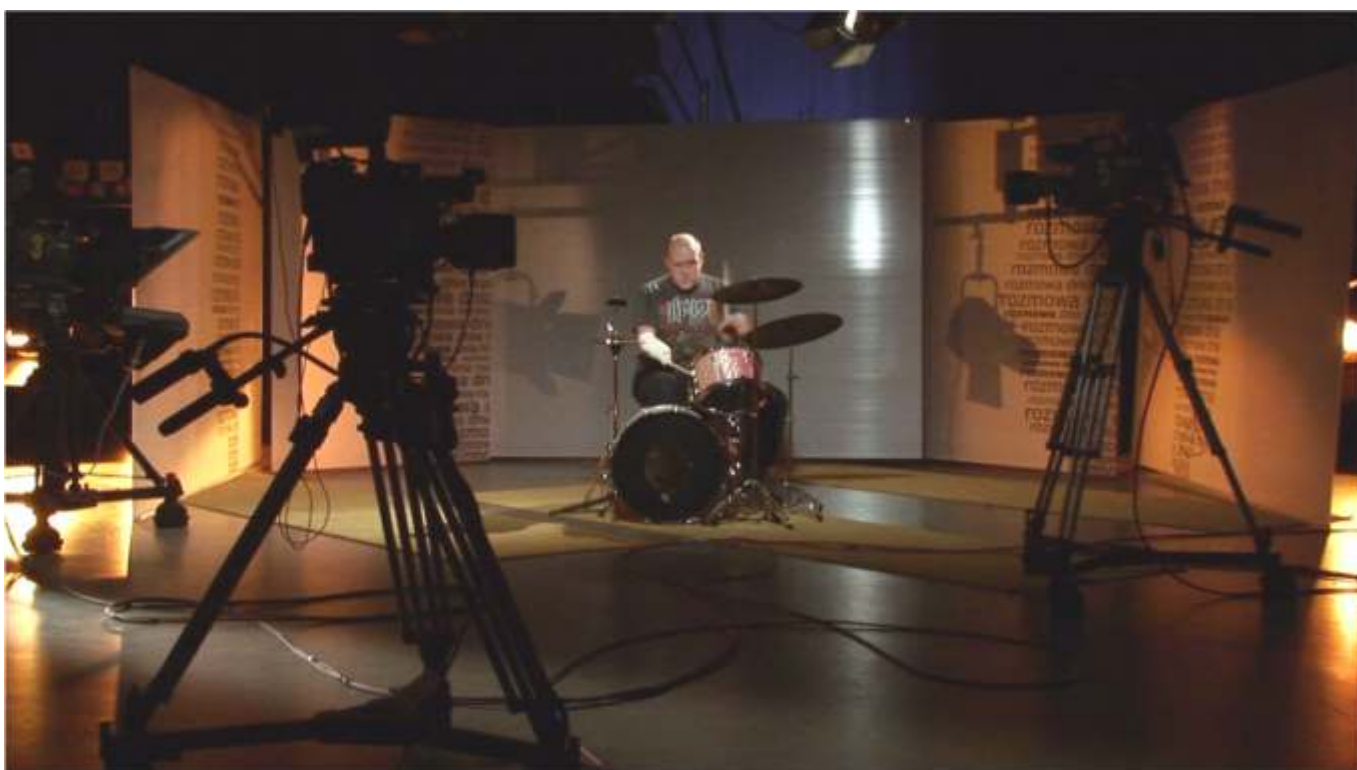
„Axe”, 2007, video 10:00 min (loop)