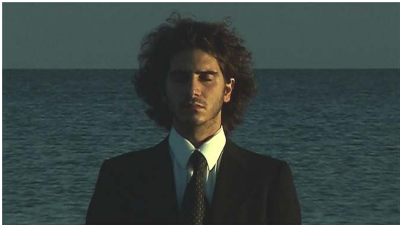
„Quisque”, 2006, video 7:00 min. (loop), channel 1 of 7