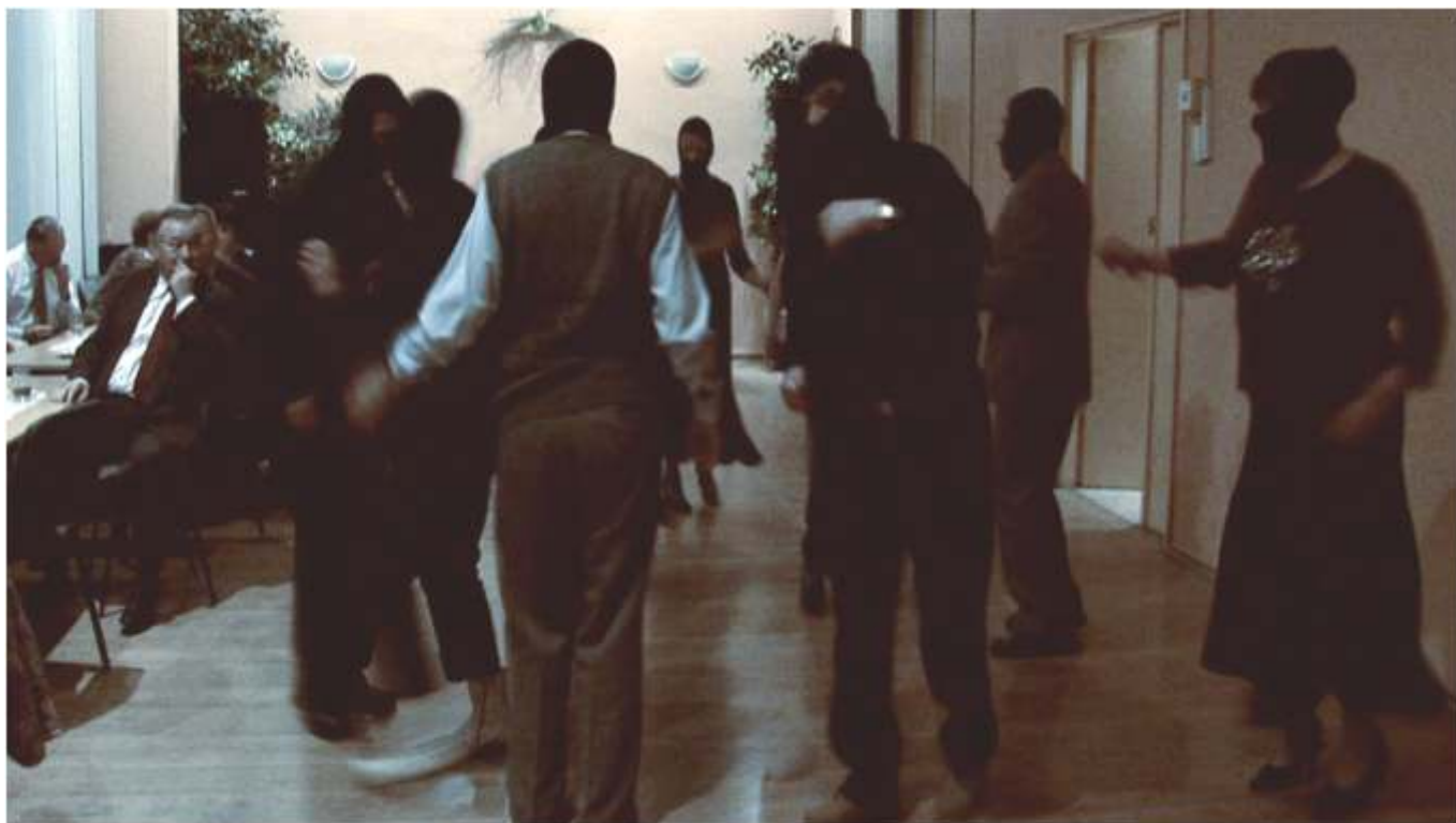
„Ball”, 2007, video 4:30 min. (loop)

Hazard project aims to depict the wrong places at the wrong time. Situations shown on the Hazard videos are trying to grasp specific elementary mood, which can be found in Greek tragedies, fairy tales by the Grimm brothers as well as Lars von Trier's screenplays. It is a search for a common denominator of these stories, which is also present in our daily experience. In school, we were taught that it is all about the fate or slings and arrows of outrageous god or gods. However, maybe it is rather the risk which we breathe in, unpredictability of beautiful chaos which we live in, and which we carry inside us. Today gold, tomorrow dust. Eeny, meeny, miny, mo.