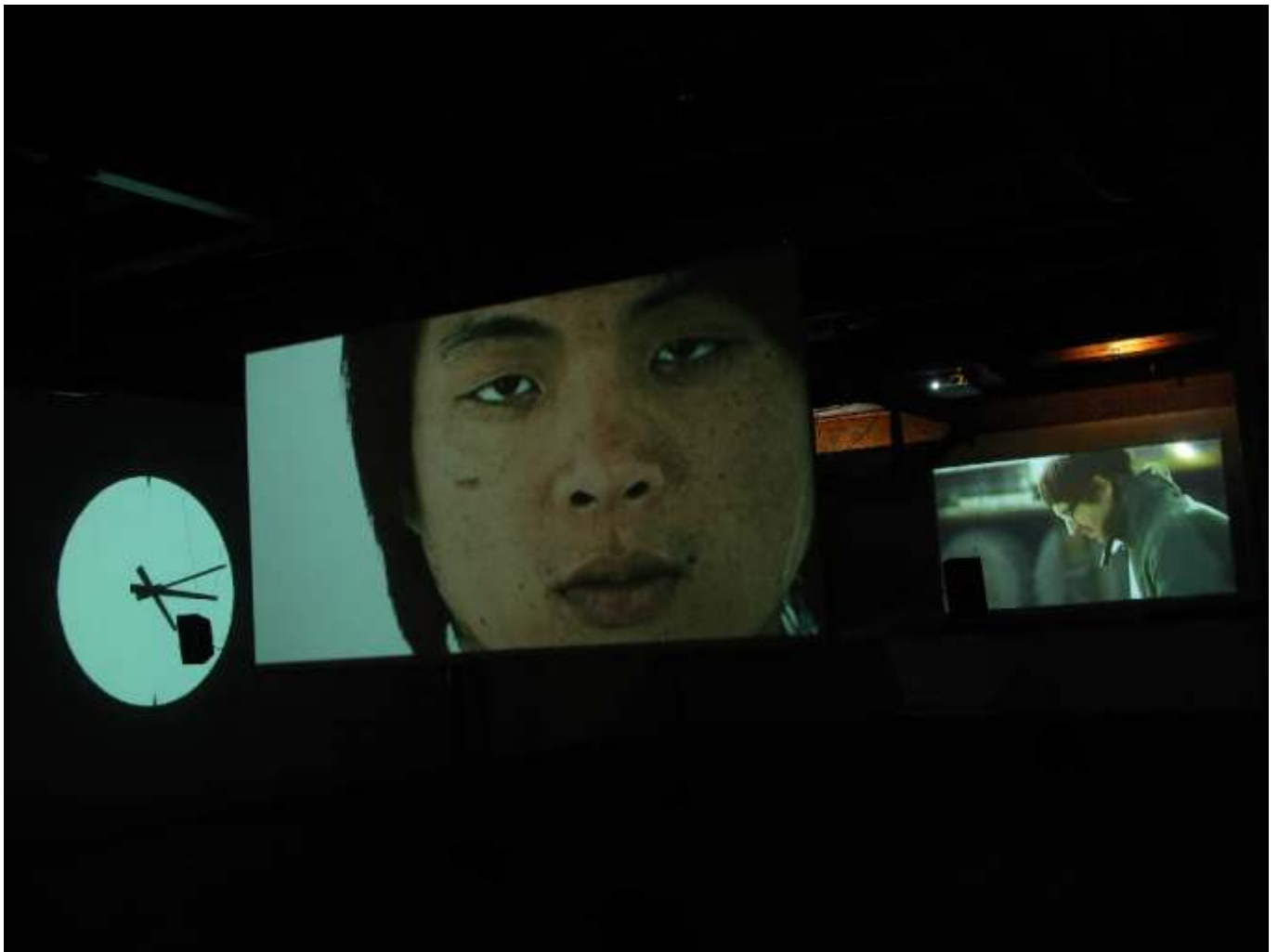
installation view in Słodownia Gallery, Old Brewery in Poznań, 2006

Krzysztof Pijarski, excerpt from the Empire of Senses catalogue