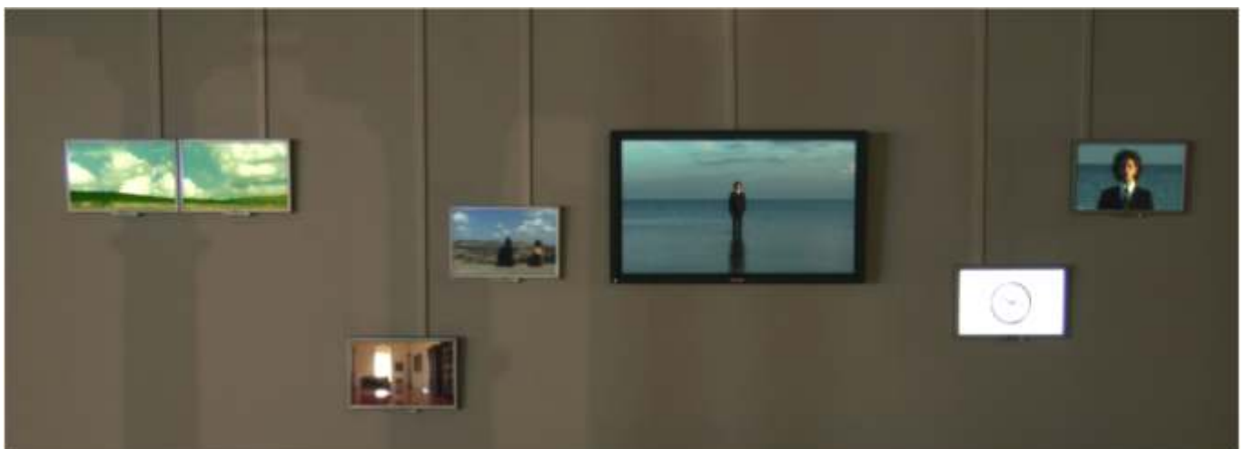
Timeless 2.0 installation view, Stodownia Gallery, Old Brewery in Poznań, 2007

Paweł Leszkowicz, excerpt from the Empire of Senses catalogue