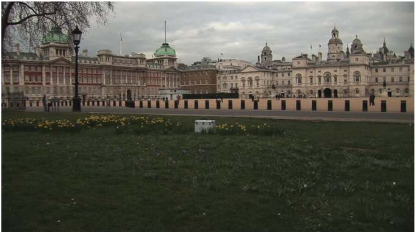
„Suitcase“, 2008, video 13 min. (loop)

Hazard Cycle is being realised by 4! group since 2007. Four images have been produced until now: "Tent", "Ball", "Axe" and "Suitcase". Altogether, they build a multi-channel, interconnected video installation. Their soundtracks fill the space, overlap and compete with each other. "Axe" for four minutes and fifty seconds drowns out the rest of pieces which fall silent for five minutes and ten seconds. "Ball" fills the opposite space, simply distorted music emphasizes the atmosphere of the image. "Tent" consists of two panoramic projections juxtaposed to recount a sad story of two girls who made their getaway to the wood. "Suitcase" is a video initiating the second part of the cycle which will concentrate on "still lifes in action". As opposed to the first cycle which took shape of portraits, the second one will focus on objects involuntarily coming into life in a space filled with noise.